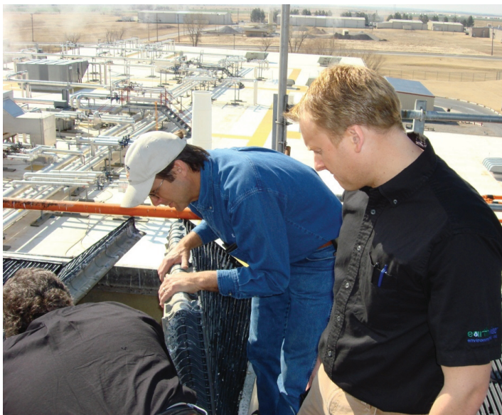
The Earthwise Environmental team inspects an ammonia evaporative condenser at the Lawton, OK meat processing facility.

Experts recommend a complete mechanical and system evaluation of plant operations, from sampling to data analysis, to determine the best fit of technology, products and services. When a chemical approach is decided, specialists should work closely with chemical manufacturers and clients to determine the custom blend that best meets clients' water treatment needs. 🌱