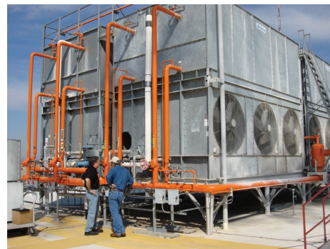
One of Earthwise Environmental's CWTs is joined by an engineer during a review of Legionella prevention tactics in front of a cooling tower at a major Bar-S Foods Co. meat processing facility in Lawton, OK.

There are several common techniques to disinfect water systems for Legionella organism control. Proven effectiveness varies. When determining disinfection methods, individual water system managers are encouraged to weigh effectiveness, implementation cost, potential for plumbing corrosion and environmental impact.